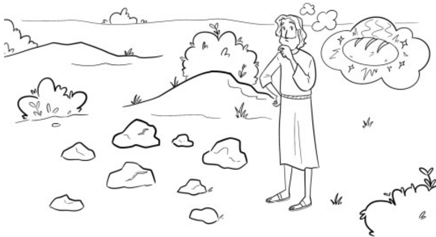
Jesus is tempted in the wilderness, but he knows to rely on God.

Jesus faces temptation and relies on God to get through it.