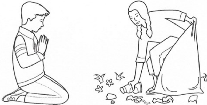
Jesus taught us to pray, but also to DO!

When someone asked Jesus how to pray, he told them not only what to say but how it might be answered.