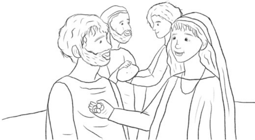
The rich shared what they had, and the apostles gave it to those who needed it.

After Jesus had risen and returned to heaven, his followers found new ways of living as community.