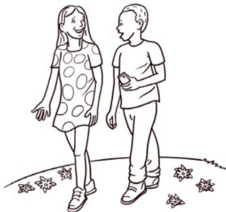
Jesus teaches us how to solve problems with other people.

Jesus taught his disciples how to deal with disagreements and conflicts with other believers by talking fairly and calmly about the problem.