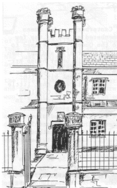
The Quadrangle - St. Bees School

Edmund Grindal, an Archbishop of Canterbury in the reign of Queen Elizabeth I, had been born in the village at a house on Crosshill (which can be seen on Circular Walk 1). When he died in 1583 he left provision for the founding of a school here. The block on the left of the Quad is the original Elizabethan school and includes a lintel dated 1587. The remainder of the buildings you can see here date from around 1840, and for many years the arched alcove in the roadside wall held a public drinking fountain.