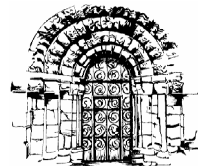
The Norman Arch which forms the west doorway of the Priory

If time permits, the interior of the Church is well worth a visit. There are descriptive pamphlets and postcards available inside. Today this is the Parish Church of St. Bees. Visitors are welcome to join in the services .