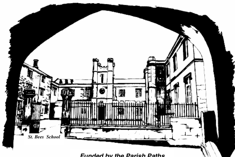
St. Bees School

Via Gutterfoot, Scalebarrow and the Dandy Walk