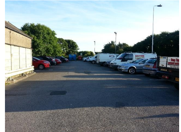
Existing car park

Location of car park and proposed extension (see next page)